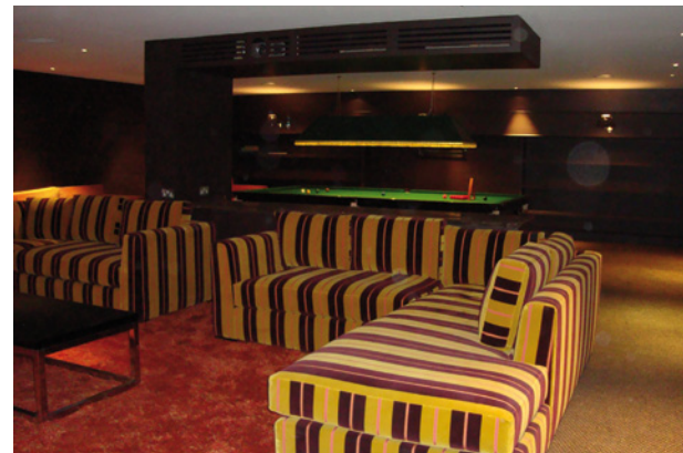
Underfloor heating was installed over the cavity drain membrane system throughout the basement

Further press information about Triton is available from Alison Hopkinson at Hopkinson White: