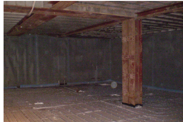
The existing basement after installation of cavity drain membranes