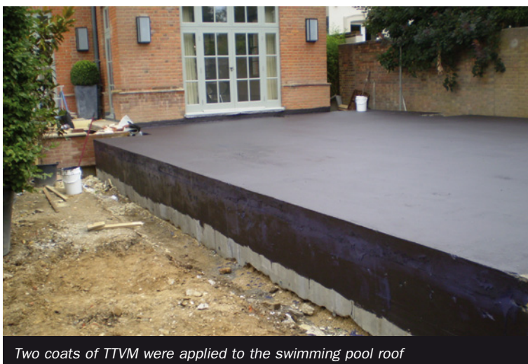
Two coats of TTVM were applied to the swimming pool roof

Triton's TT Vapour Membrane and Platon Double Drain was used to waterproof the roof of the new, two storey deep swimming pool, which extends under a new landscaped patio. Closed cell insulation was installed over the steel beam and concrete plank roof before applying a 75mm screed with a fall to drainage and two coats of Triton TT Vapour Membrane. (This product is designed to be used as an alternative to sheet waterproofing membranes in new construction but can also be retro-applied as a waterproof or gas-proof membrane.) The TT Vapour Membrane was extended down over the edge of the roof construction to waterproof the construction joints, with reinforced glass fibre mesh sandwiched between the two coats to take up any movement. Platon Double Drain membrane was then laid over the cured TT Vapour Membrane and linked to suitable land drains, before laying a mortar bed and paving and planting the surface.