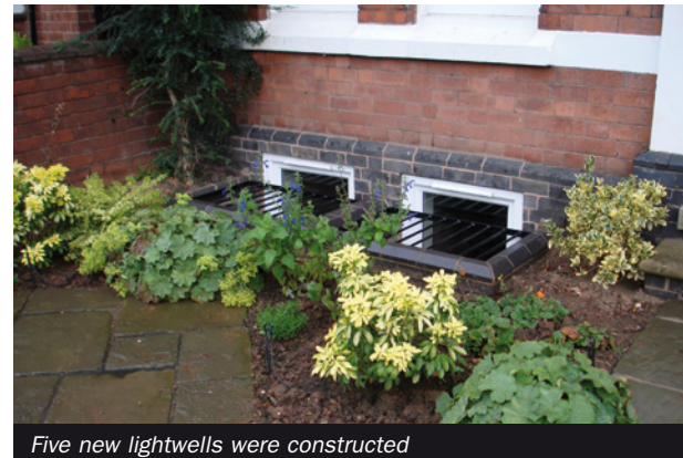
Five new lightwells were constructed