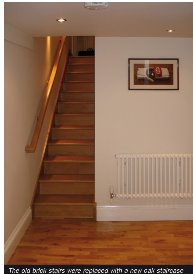
The old brick stairs were replaced with a new oak staircase