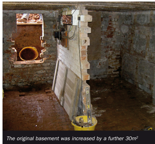
The original basement was increased by a further 30m 2

Large areas of underpinning were involved with the earth taken down to achieve a 2.5m head height. Two internal partition walls were built and some existing internal walls removed to suit the new internal layout.