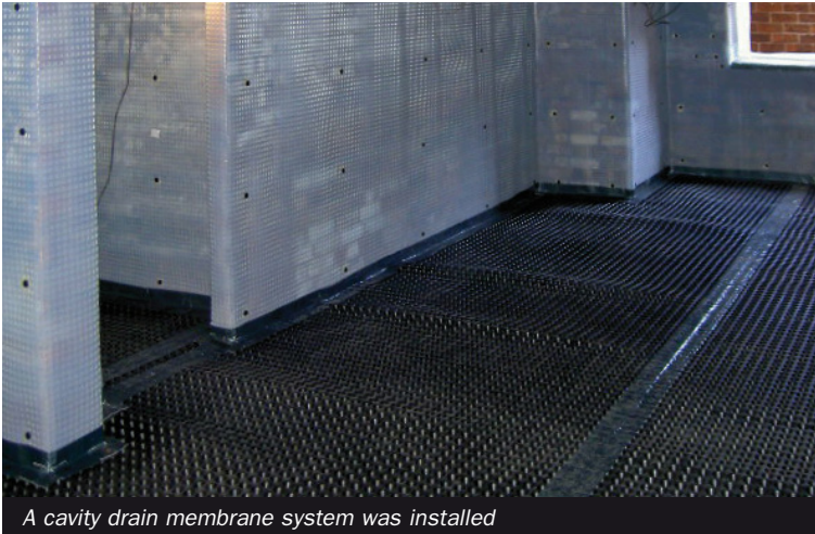
A cavity drain membrane system was installed

Dampco used Platon P5 cavity drain membrane on the walls and heavy duty P20 membrane on the floor. Cavity drain membranes work on the principle of allowing water to continue to penetrate the structure but control it in the air gap and divert it to a suitable drainage point. They do not allow pressure to build up against the internal construction and the air gap behind the membrane allows the structure to breathe. Once the membrane has been fitted, wall surfaces can be dry lined or plastered directly and floors can be screeded or a floating dry board system installed.