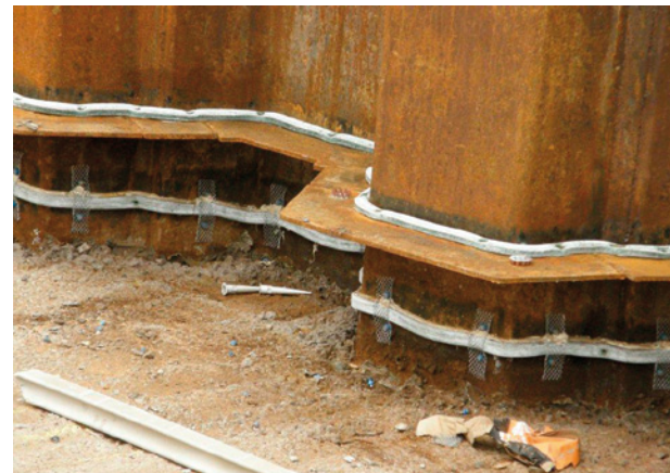
Triton's TT Waterstop and TT Swellmastic to construction joint detailing

The depth of the basement, the high water table and the close proximity of the River Lee (10 metres away) led to a combination of waterproofing systems being specified in view of the intended use of the structure (retail and office space). The combination system (as defined by BS 8102: 2009) comprised a structurally integral type B system (welded sheet piling) on the walls; a drained type C system to walls and floors (a complete internal cavity drain membrane system); and a barrier type A membrane beneath the floor slab.