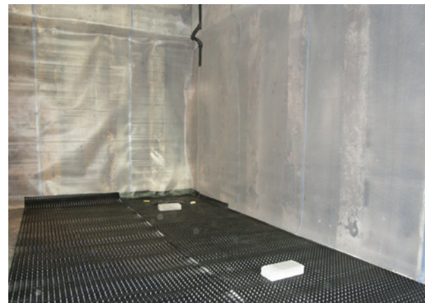
3000 m 2 of heavy duty Platon P20 was then laid to the floor