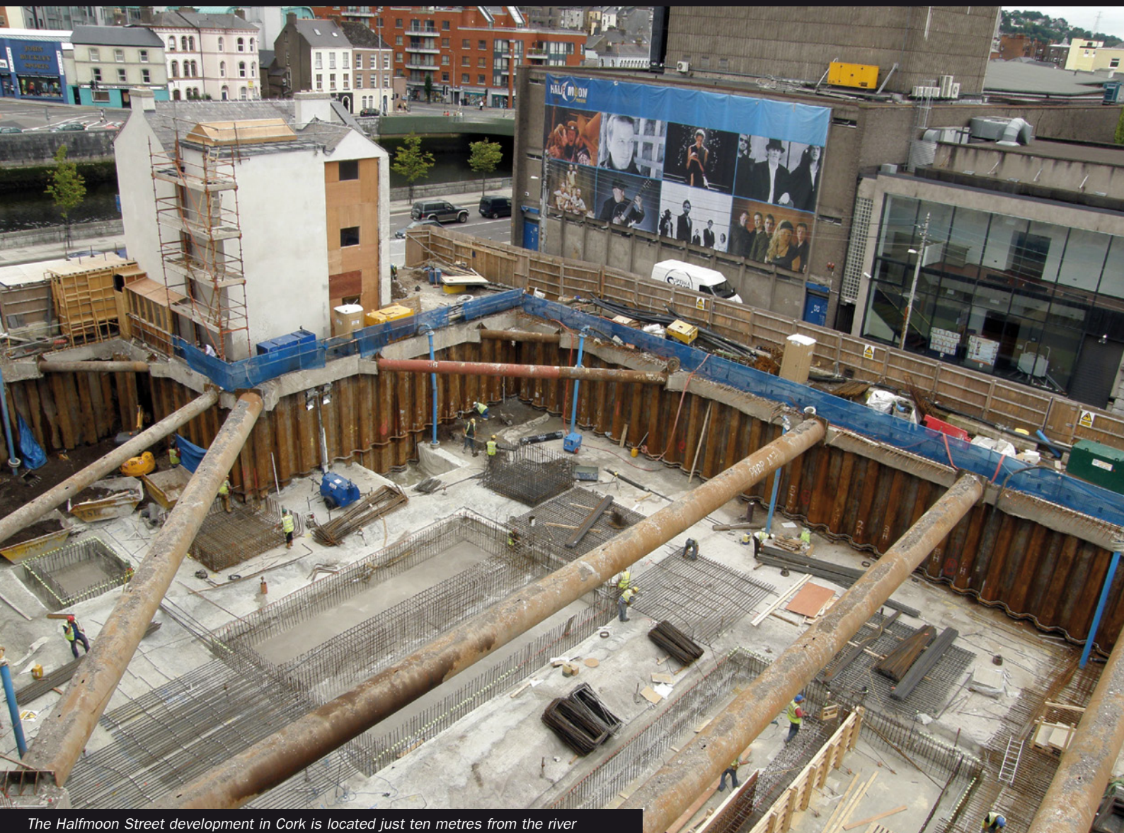
The Halfmoon Street development in Cork is located just ten metres from the river

Platon Multi (210 M), TT Vapour Membrane, Platon P20 Membrane (3000 M 2 )