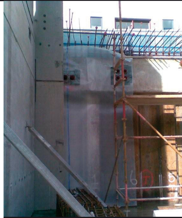
Platon Multi was first fixed to the sheet piling walls

Sheet piling supplied by Sheet Piling UK Tel 01772 79 41 41 www.sheetpilinguk.com